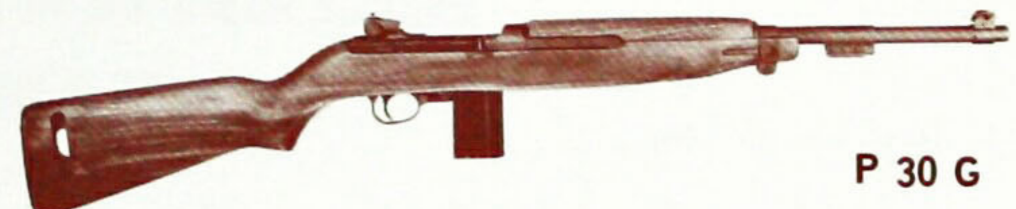
P 30 G

New, .30 cal. military version of the carbine. Gas operated, 18" six groove barrel, semi-automatic, 15 round magazine, inletted for sling and oiler, air cooled handguard and walnut stock. Weight 5½ lbs. Wooden handguard optional.