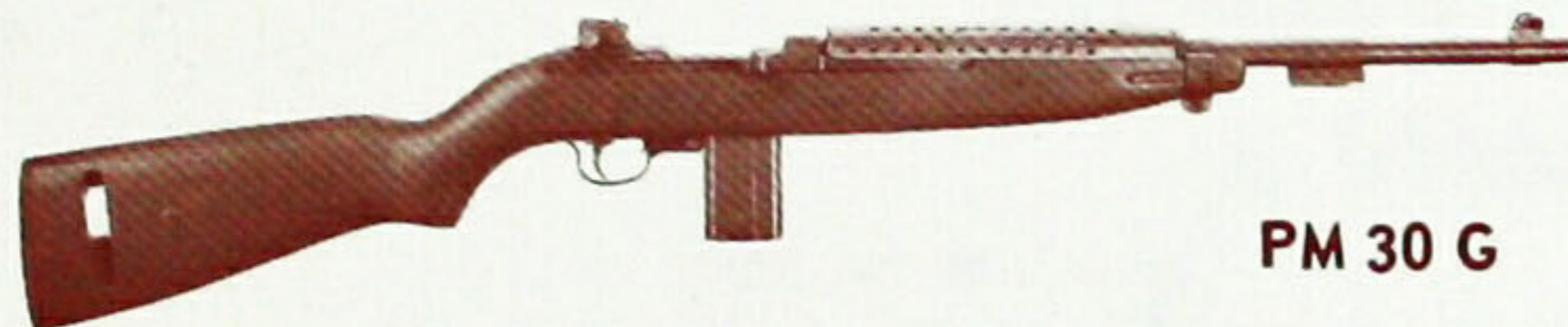
PM 30 G

The light weight, large magazine capacity, semi-automatic fire and negligible recoil of this fine weapon is finding ever increasing acceptance by sportsmen and sportswomen who enjoy a gun that will perform in the field and on the range with both accuracy and dependability.