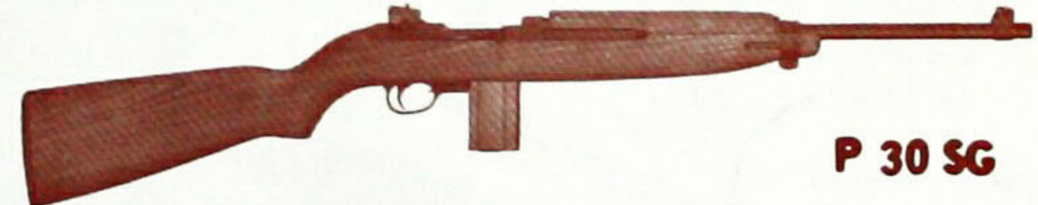
P 30 SG

New, .30 cal. military sporter. Solid walnut stock, gas operated, 15 shot magazine, 18" six groove barrel, wooden handguard and short barrel band.