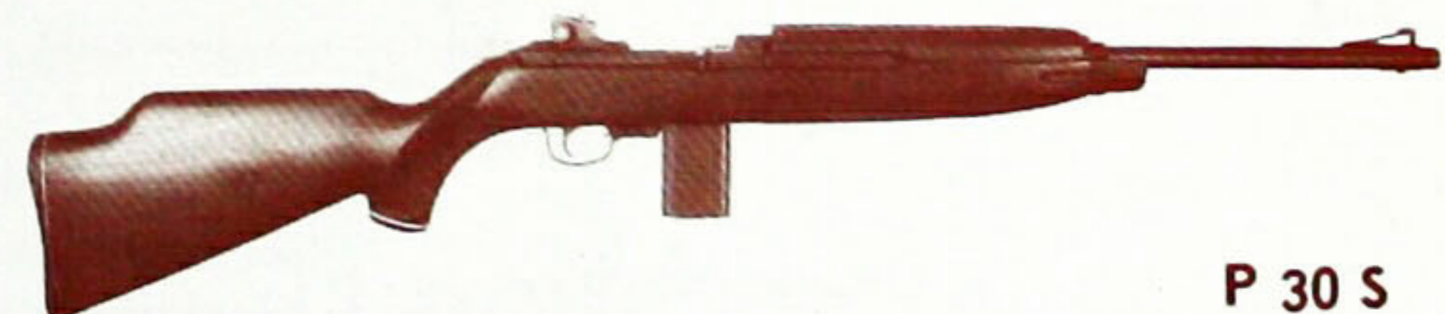
P 30 S

The Deluxe PLAINFIELDER is a deluxe sporter fitted with a premium grade, finely grained, hand-checked American walnut stock with high comb, satin finish and matching handguard. Pistol grip and ramp type front sight.