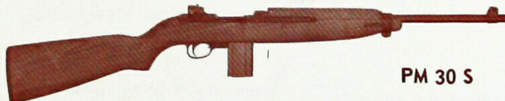
PM 30 S

Identical to PM 30 G with a high gloss, epoxy finish which highlights the fine American walnut stock.