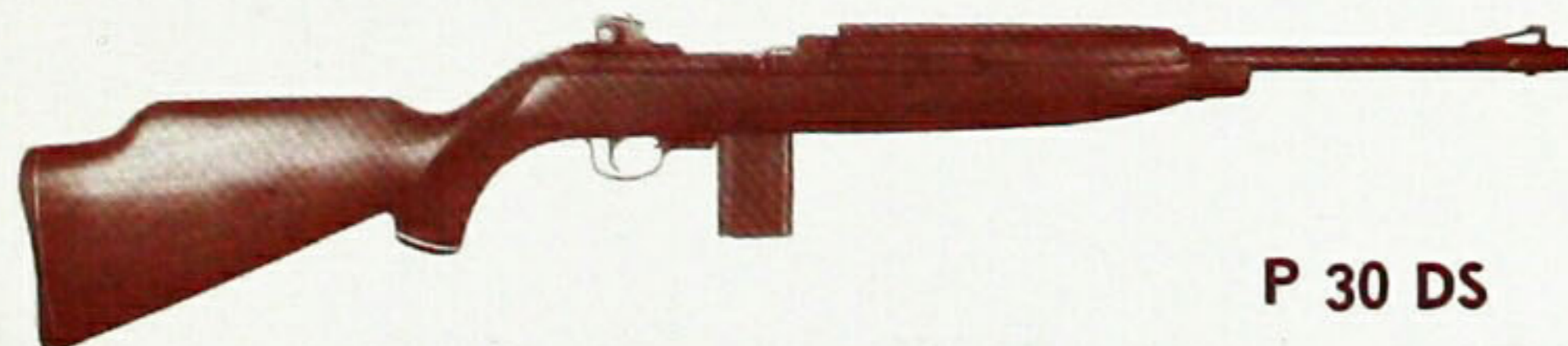
P 30 DS

Identical to PM 30 S with a high gloss, epoxy finish which highlights the fine American walnut stock.