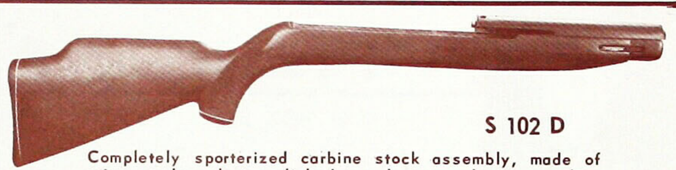
S 102 D

Paratrooper stock, telescoping shoulder stock, air cooled steel handguard, made of American walnut with military type oil finish. Complete with necessary fittings to insure that carbines manufactured to U.S. Government specifications will fit with no additional inletting.