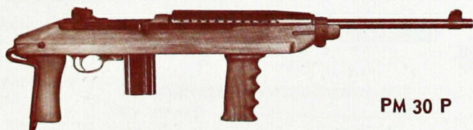
PM 30 P

PLAINFIELDER – Identical to P 30 DS without checkering.